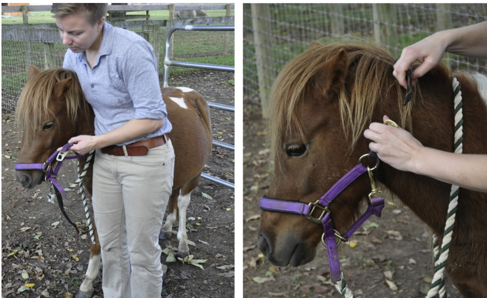
Figure 3. Approach and haltering.

et al., 2003) and escape avoidance behavior during a mildly aversive simulated health care procedure (Watson and McDonnell, 2018). Primary positive reinforcement (innately positive) was paired continuously with the spoken word “good” as a secondary reinforcer (acquired positive value as the result of pairing with primary reinforcement). The “good” was delivered to mark the desired response in a manner similar to use of a clicker in clicker training, with the primary reinforcement delivered simultaneously or with minimal delay (usually within less than a second). For early