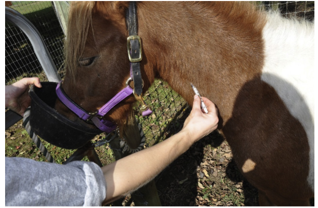
Figure 16. Grain as a distractor/reinforcer.

antidepressants and selective serotonin reuptake inhibitors is required to reach maximum effectiveness, so these medications may be cost-prohibitive for horses.