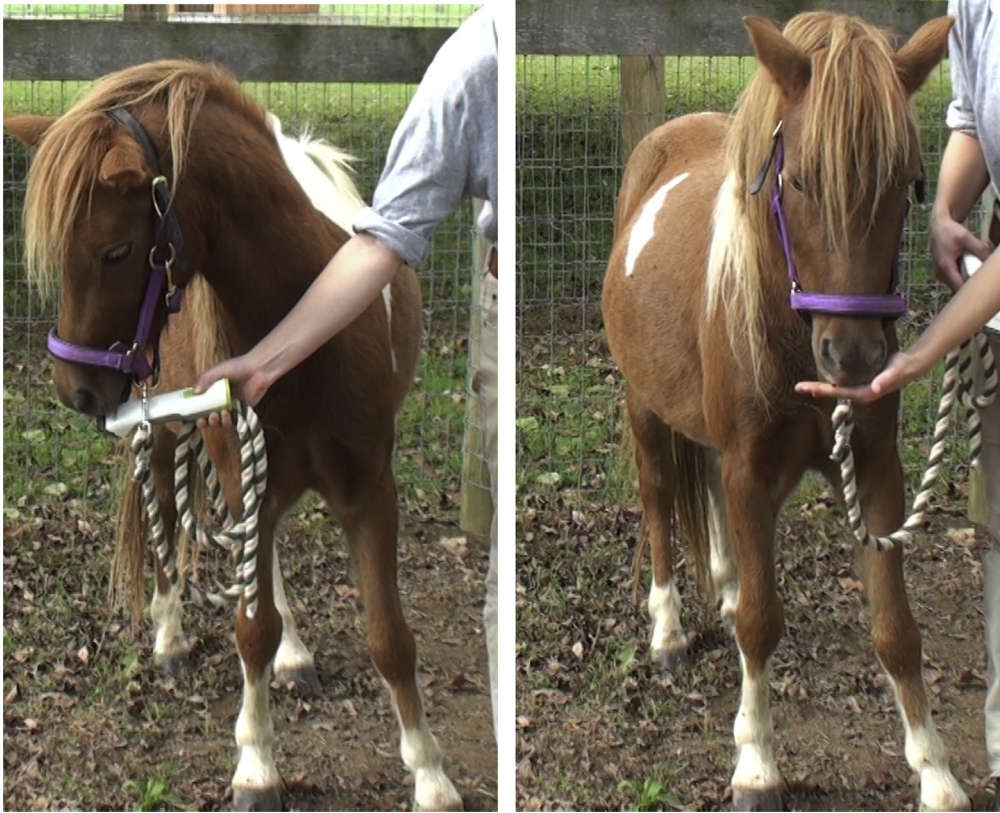
Figure 17. Clipper acclimation procedure: Left panel illustrates pony reaching to touch muzzle to clipper when presented at various locations. Handler says “good” as the muzzle touches and then immediately offers grain (right panel).

It is important to recognize that physical discomfort may contribute to attempted avoidance of health care procedures that are typically tolerated by most horses. For example, when lifting limbs, especially in ponies, physical discomfort and loss of balance are factors to be considered. Horses, particularly small horses and ponies, may have difficulty learning how to maintain their balance when their limbs are lifted. Holding a limb, particularly a hind limb, in a position that is ergonomically comfortable for the handler (high and out to the side) can be painful to the horse's limb joints. When the technique is modified to keep the horse's comfort in mind, avoidance behaviors conspicuously decrease. For example, Rolf Gruber's discomfort due to bilateral upward fixation of the patella was judged to be such that continuing to attempt limb lifting was detrimental to his rehabilitation overall. When limb lifting was discontinued, Rolf Gruber appeared more relaxed for all other procedures.