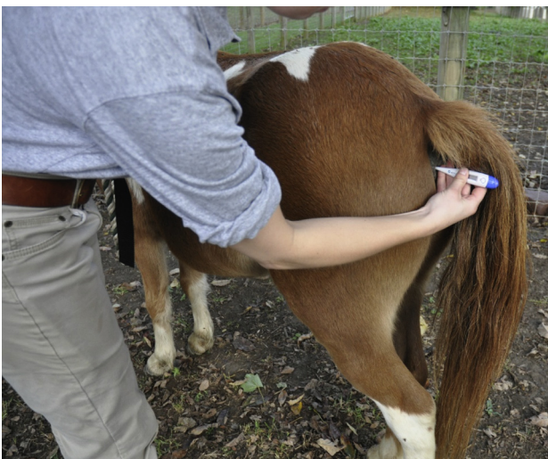
Figure 9. Rectal thermometer insertion.

In early sessions, 3 ponies (Do Re Me, Austria, and Ziggy) had a tendency to step forward, back, or laterally away from the handler when working in the open area of the enclosure. Do Re Me also tended to turn her head into the handler, sometimes threatening to bite. These movements were effectively limited by strategically