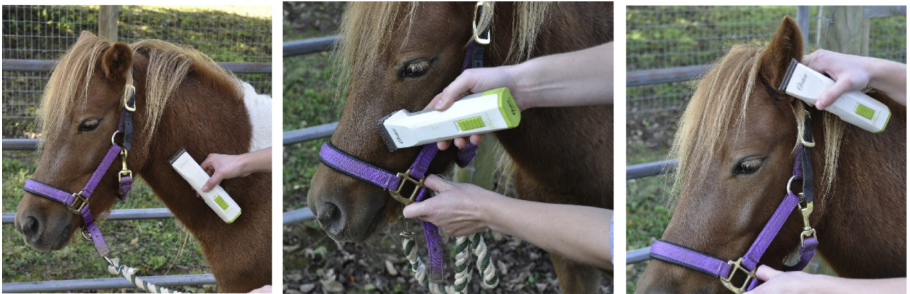
Figure 12. Simulated clipping of the jugular groove, face, and ears.

principles when rehabilitating animals with aversions to handling and health care procedures, as reviewed for horses and other species (Foster, 2017; Hanggi, 2005; Landsberg et al., 2003; McDonnell, 2000; McDonnell, 2017; Overall, 1997).