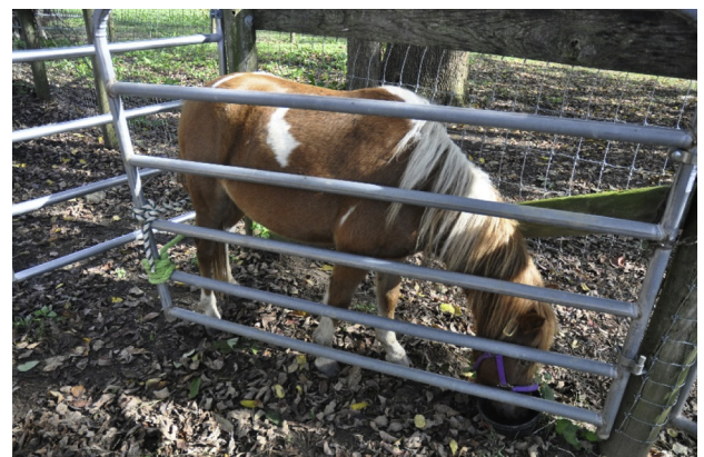
Figure 2. Stocks-like subenclosure.