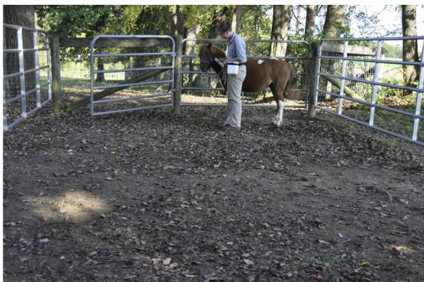
Figure 1. Enclosure used for behavior modification sessions.

The general behavior modification approach was positive reinforcement-based systematic desensitization and counterconditioning (McGreevy, 2004; Mills and Nankervis, 1999). Each session consisted of progressing through the entire battery of health care procedures detailed in Table 2 and illustrated in Figures 3–13, in the order listed. Session length varied as determined by the handler based on pony tolerance and progress, with the aim to end each session with 1 or more replicates of reinforcement for a well-tolerated procedure. Session duration (animal contact time)