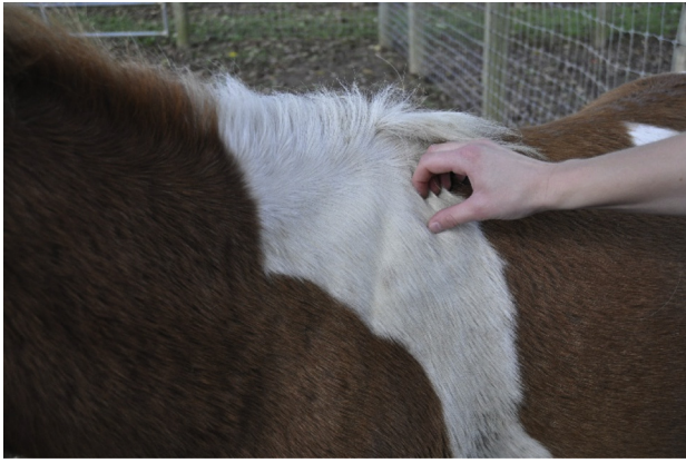
Figure 14. Scratching withers as positive reinforcement.