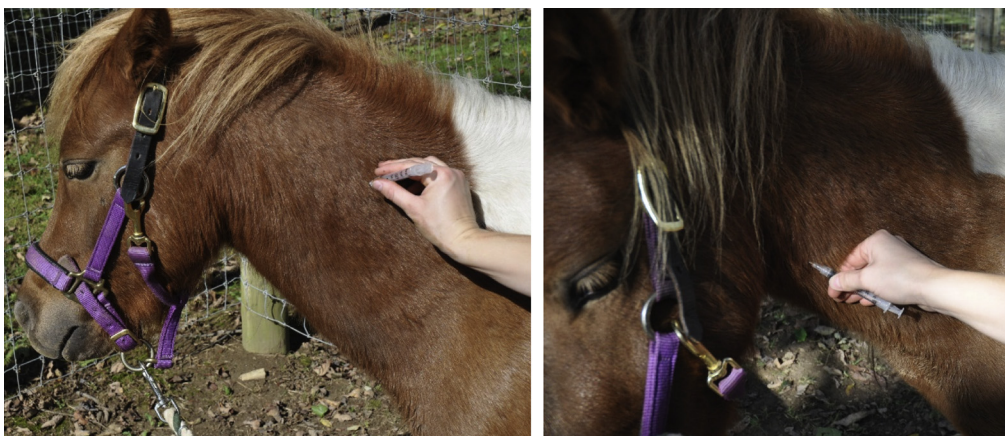
Figure 11. Intramuscular and intravenous needle sticks.

Rehabilitation of these 5 ponies with a total of 31 specific mild-to-significant health care procedure aversions proceeded efficiently and safely for both handler and ponies. This illustrates the value of implementing positive methods based on well-tested learning