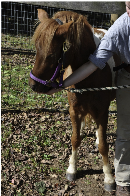
Figure 15. Grain fed to the offside.

Our many years' experience of using these once semiferal ponies as “patients” in a veterinary course has emphasized the factors contributing to the development of aversions to health care procedures, even for animals that start out compliant. In this teaching hospital environment, obvious risk factors include a variety of different people (staff and students) interacting with the ponies and performing mildly aversive procedures. These people have varying skill levels, confidence with the procedures, and styles of human-animal interactions. The general stress inherent to a 6-week hospitalization, particularly for animals recently introduced to domestic care, likely exacerbates the risk. These factors are often difficult to control and so must be managed as much as possible. Students are encouraged to recognize escape avoidance behavior early and to seek coaching by experienced technicians from the Equine Behavior Program, who are regularly present during the course to provide support. In most instances, with instructions, students are able to successfully implement basic behavior modification methods to avoid development of significant aversions.