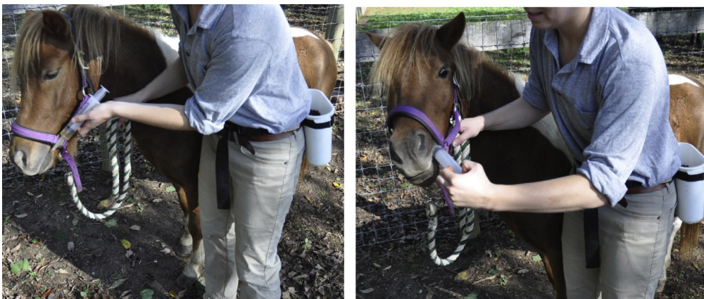
Figure 13. Oral dosing.

In dogs and cats, psychotropic medications are often prescribed as an adjunct to training for behavior modification in cases of anxiety, aggression, or other select behavior problems (Hart et al., 2006). Few published data are available on the efficacy of psychotropic medications in horses. There is research evidence for the use of psychotropic medications as an aid to behavior modification in stallions suffering from psychogenic sexual dysfunction and to horses with locomotor stereotypies (McDonnell et al., 1985; McDonnell, 2011), but to our knowledge, no data have been published on the use of such medications as an aid for behavior modification of health care aversions. Crowell-Davis (2009) reported clinical use of tricyclic antidepressants and selective serotonin reuptake inhibitors as effective adjuncts to behavior modifications of horses with human-directed aggression. As noted by Crowell-Davis, long-term (4–6 weeks) treatment with tricyclic