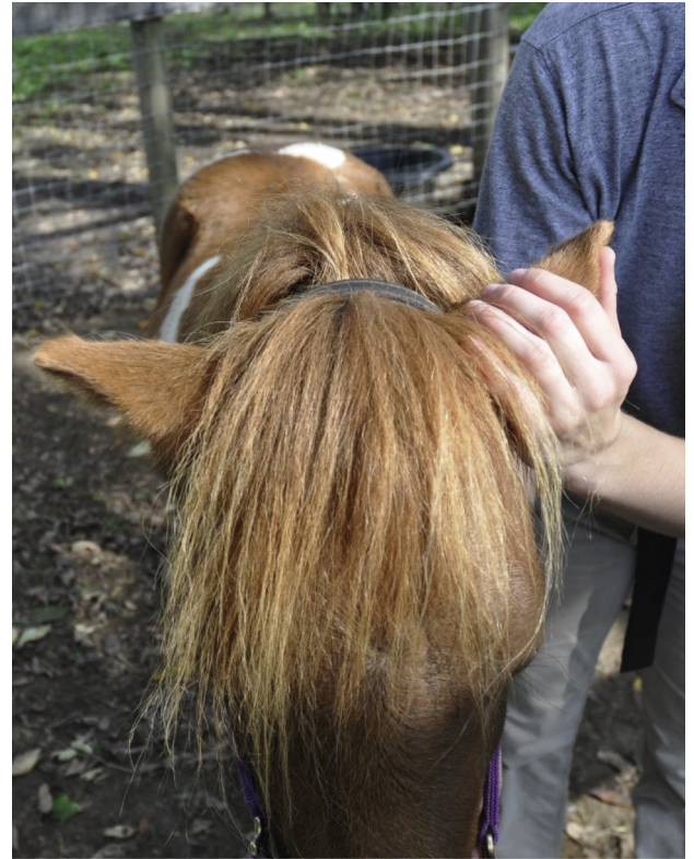
Figure 6. Ear manipulation.

sessions, grain reinforcement was given on a continuous schedule. As tolerance of the procedures progressed, grain was given on an intermittent variable ratio to effect (Schwartz, 1978). For some horses and ponies, reinforcement with highly palatable food may lead to anticipatory behavior (Peters et al., 2012), which at times may be directed toward the handler (nudging or nipping). Care was taken to deliver grain reinforcement only when the pony was not nudging or otherwise gesturing to the handler in anticipation. For those with the tendency to nudge or nip in anticipation, the grain was purposefully delivered to the offside by reaching under the muzzle (Figure 15) as counterconditioning to turn away rather than toward the handler in anticipation of reinforcement (response substitution). In spite of these efforts, with 2 ponies (Do Re Me and Rolf Gruber), grain reinforcement elicited problematic anticipatory responses (head butting, nipping). For these 2, scratching was substituted as the principal primary reinforcement on a continuous schedule. Grain or scratching was used as a positive distractor (Figure 16) as needed during the most uncomfortable part of certain