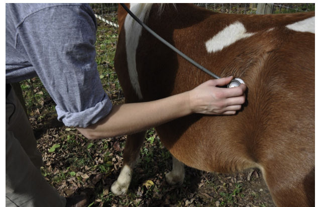
Figure 7. Auscultation.